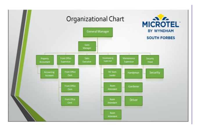
Figure 2. Organizational Structure of Microtel by Wyndham South Forbes

A skeleton force additionally keeps on working under the rules to support its occupants. Figure 2 shows the current organizational structure of Microtel South Forbes.